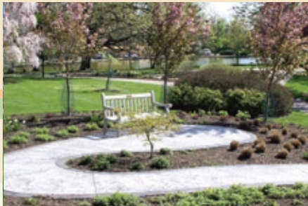
Teak Bench by Cincinnati Parks