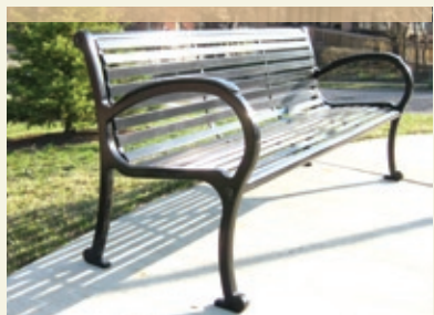
Contemporary Bench by Cincinnati Parks

Your donation funds the acquisition and installation of a permanent bench, as well as funding for its care and maintenance for a period of ten years. Donating a bench is an ideal way to honor the past while preserving park tranquility for the future. Each bench is $3,000.