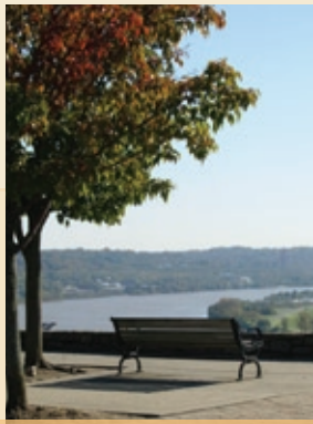
Victorian Bench by Cincinnati Parks